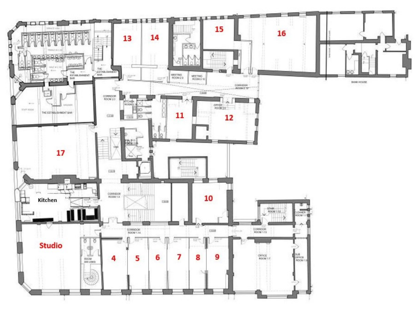
FIRST & SECOND FLOOR PLAN