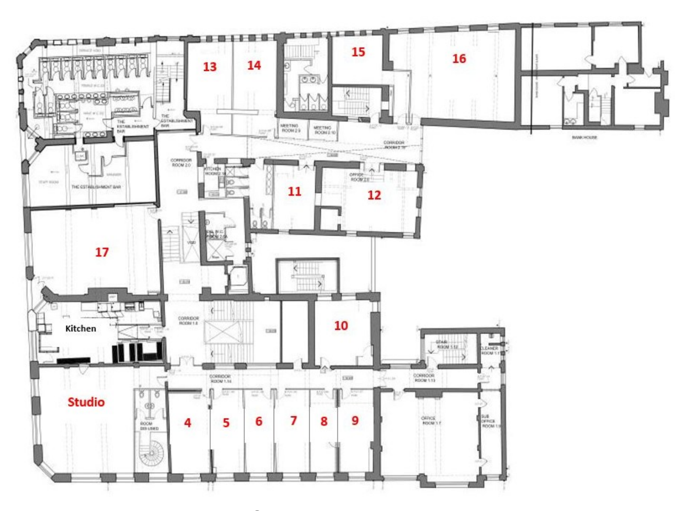
FIRST & SECOND FLOOR PLAN