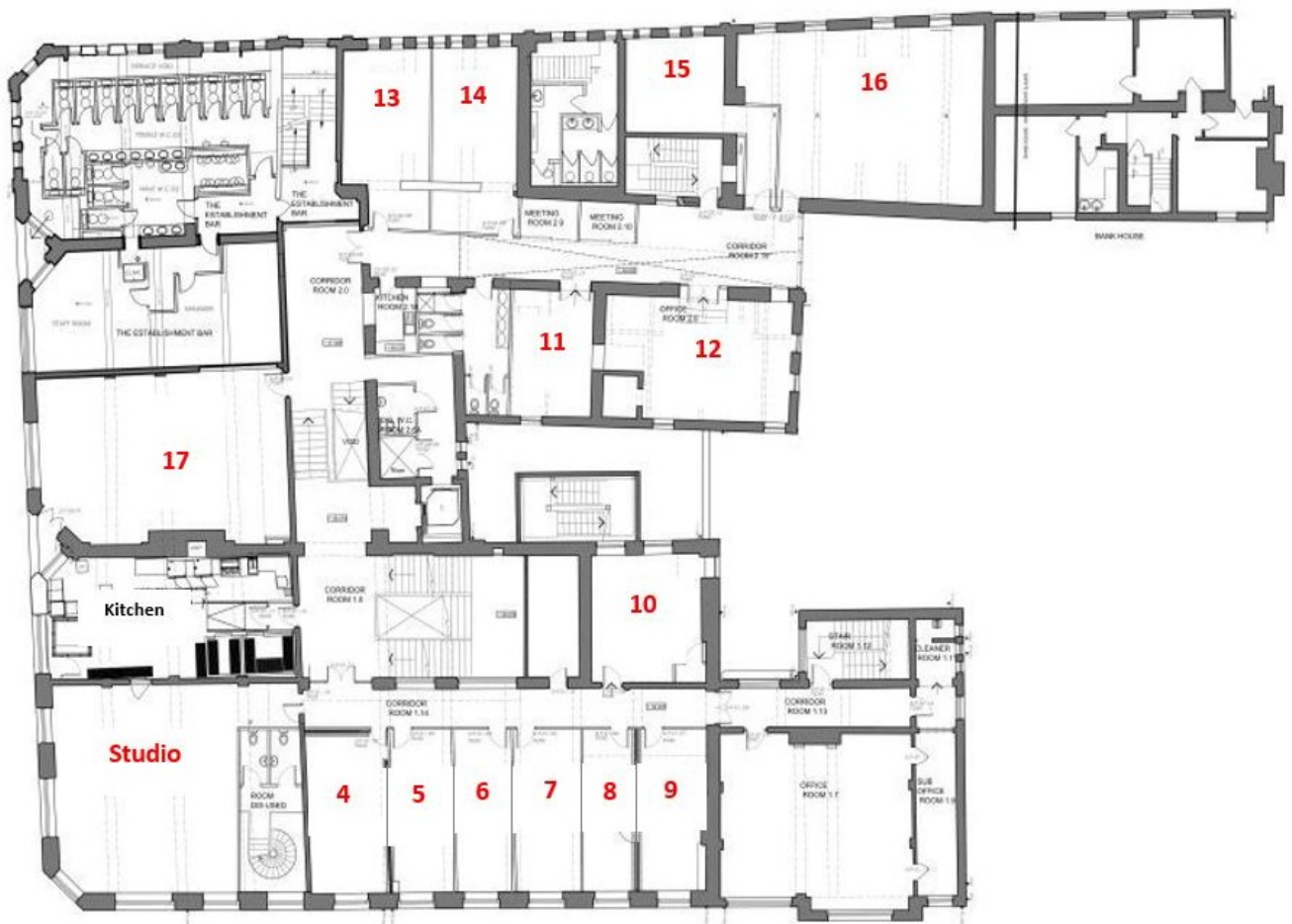
FIRST & SECOND FLOOR PLAN