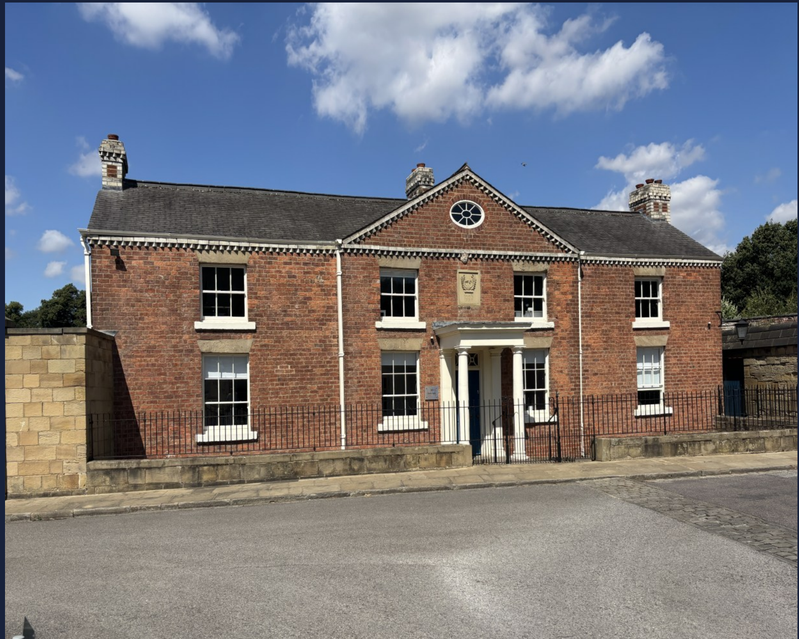
The Bothy Suite

The Nostell Estate Yard, Nostell, Wakefield, WF4 1AB