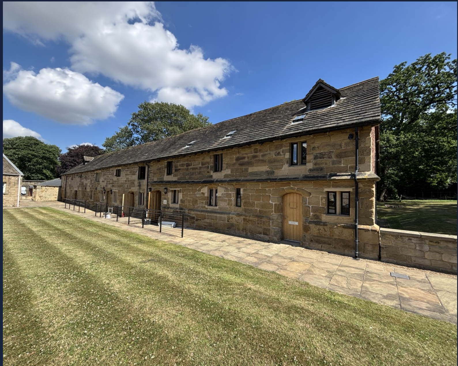
The Ward Suite

The Refectory, The Nostell Estate Yard, Nostell, Wakefield, WF4 1AB