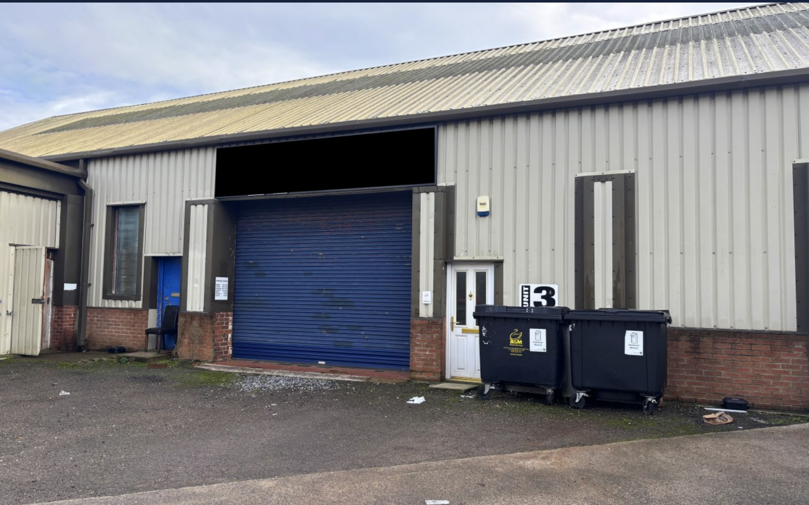
Unit 3, Caldervale Road, Wakefield, WF1 5PE